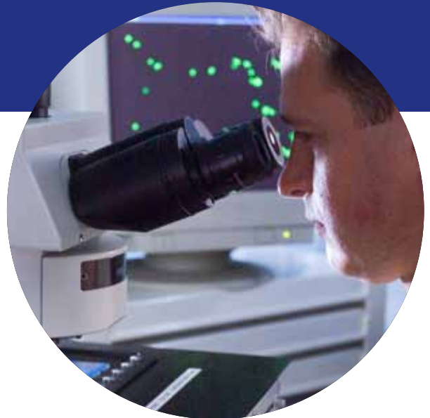
FISH microscope

In the beginning, there was Danone, already inherently permeated by the values of nutrition and health. In 1991, Danone decided to promote public health by developing and spreading knowledge about nutrition, diet and health, and set up its first Institute. Twenty years later, there are now 17 Danone Institutes worldwide, operating under the aegis of the Danone Institute International. The latter has been awarding the Danone International Prize for Nutrition every two years since 1997 to a research scientist or research team conducting noteworthy studies in human nutrition. Today, this prize is one of the Institute's key activities but also highlights Danone's long-standing commitment to nutrition and health.